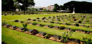
Allied War Cemetery