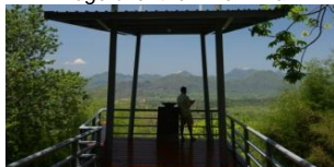
Hellfire Pass Memorial Museum