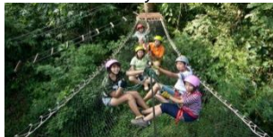
Fly in the Park