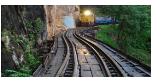
Death Railway Train