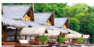
The FloatHouse River Kwai