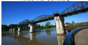
Bridge over the River Kwai