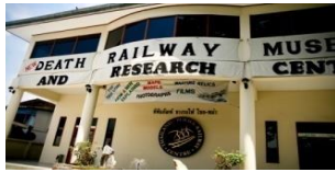
Thailand-Burma Railway Centre

Highlight: Thailand–Burma Railway Centre, War Cemetery, River Kwai Bridge, Fly in the park, Weary Dunlop Museum, Trekking, Bamboo Rafting or Canoeing, Mon Tribal Village & Temple, Death Railway Train and Stay at Home Phutoey River Kwai & Float House River Kwai