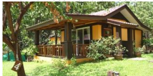
Home Phutoey River Kwai