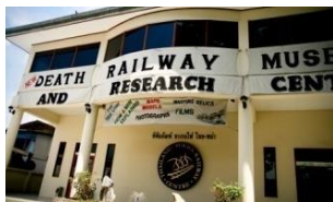
Thailand-Burma Railway Centre

Highlight: Thailand–Burma Railway Centre, War Cemetery, River Kwai Bridge, Mon Tribal Village & Temple, Hellfire Pass Memorial, Weary Dunlop Museum, Death Railway Train and Stay at Home Phutoey River Kwai