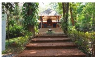
Weary Dunlop museum