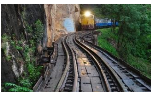
Death Railway Train