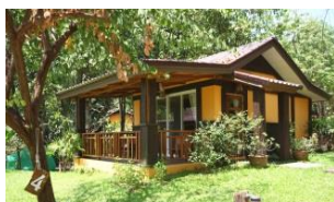
Home Phutoey River Kwai