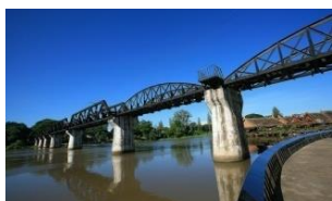
Bridge over the River Kwai