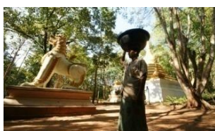
Mon Village & Mon Temple