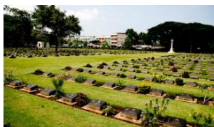
Allied War Cemetery